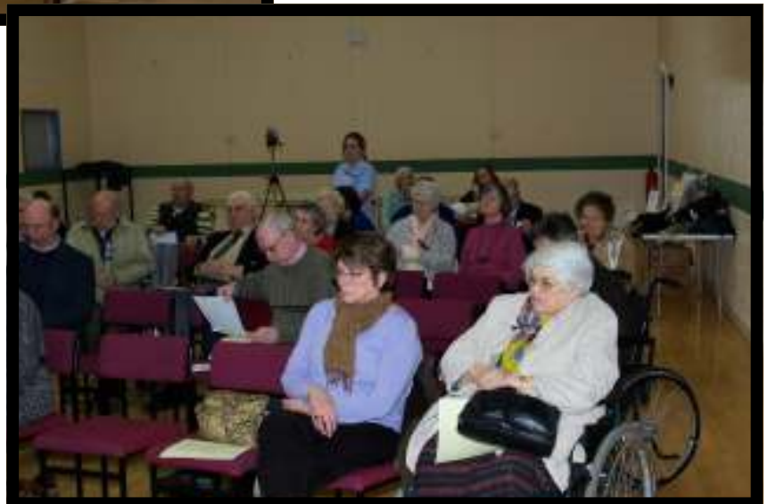
Some of the People in attendance at the meeting